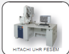
HITACHI UHR FESEM

Imaging topmost surface electron with confidence