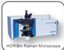
HORIBA Raman Microscope

Ultimate Raman Spectroscopy sensitivity & class leading resolutions